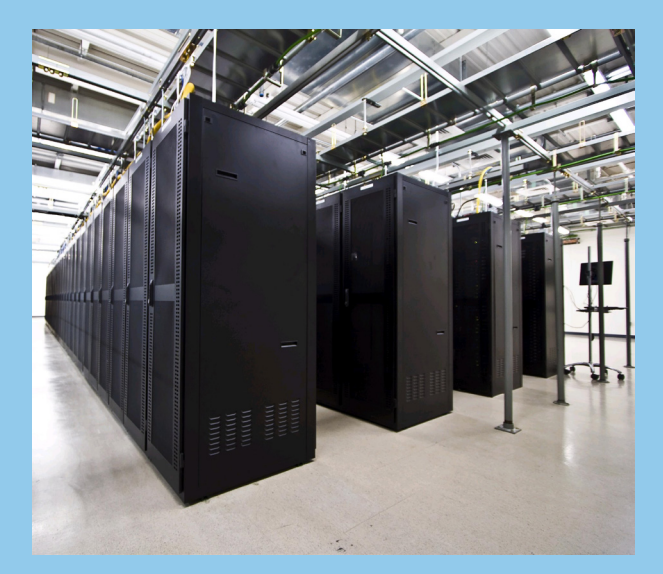
OpenData real-time monitoring allowed raising the chilled water temperature from 43°F to 52°F, which saved at least 15% of the chiller energy. The room temperature was also raised from 69°F to 74°F.

The company had two monitoring systems in an N+1 configuration: one traditional building automation system and the OpenData DCIM solution from Modius. Continuous monitoring and measurement are a key component to the operational successes, including verifying ongoing system modifications. The OpenData system provides accurate, comprehensive, near real-time monitoring data for the data center, including all generators, switch gear, uninterruptible power supplies (UPS), power distribution units (PDU), computer room air handler (CRAH) units, and wireless sensors. The data is used to discover IT and facilities inefficiencies, quantify savings opportunities, justify budgets, and measure savings.